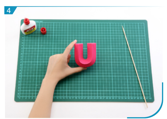
Glue U01, U02, U03 and U04 according to the assembly instruction, Letter "U" is now done.