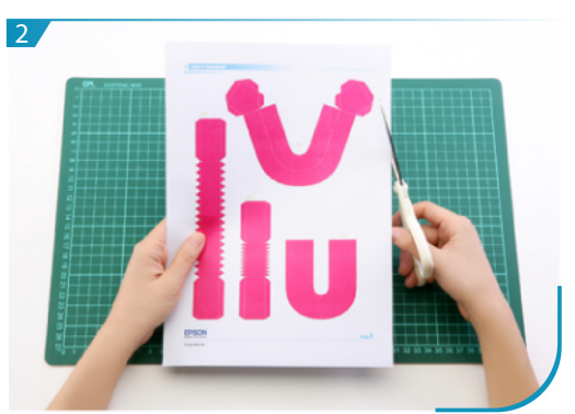
Separate all parts along the lines. Mark their identity on the back to avoid confusion.