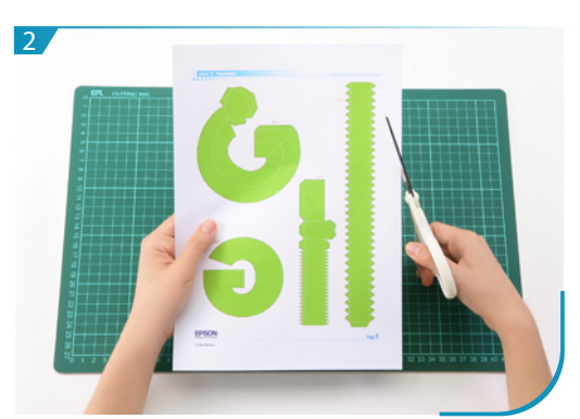
Separate all parts along the lines. Mark their identity on the back to avoid confusion.