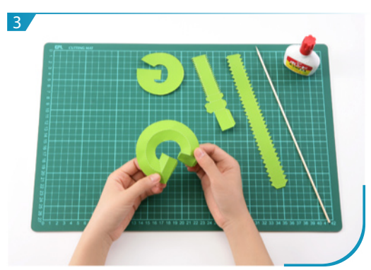
Fold and glue G01.

Use a pen whose ink has dried out, or a tracer, to trace lines first.